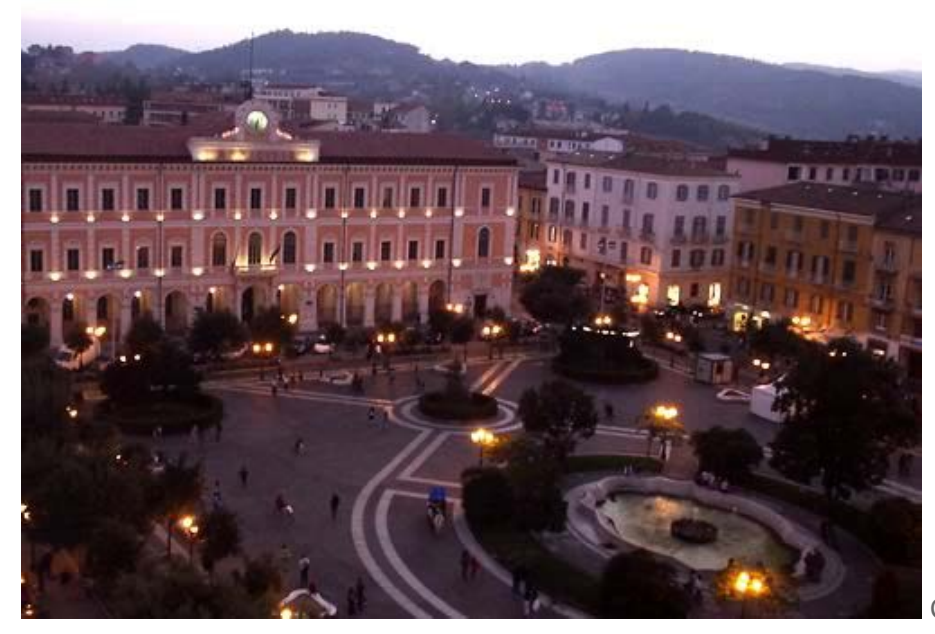
Campobasso by night

Campobasso is the administrative centre of Molise. At 750 metres above sea-level, it is situated upon the hills which go from the 'Matese' - a mountain range - to the Adriatic Sea, in the middle of an important agricultural area. Campobasso was probably founded by the Longobards and during the Middle Ages it was a very disputed feud. The old city is situated in the upper part of the territory (around Monforte Castle - XVth century), the modern one in the plain (Campus bassus). For people who come and stay here for some time, Campobasso appears a quite place, apart from the chaotic traffic in the centre of the town.