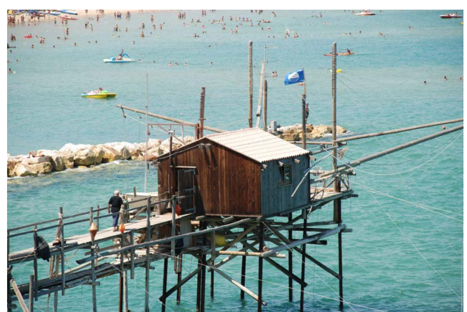
Termoli – the sea

Termoli is a tourist centre and a bathing resort. It stands at a height of 15 metres on a promontory on the coast of Molise. It is surrounded on three sides by the sea and on the fourth by the mainland with very big and strong ramparts and walls and it is guarded with only one gate leading towards the land. With a lively port, attractive beaches and a wonderful castle, situated in the old part of the town, Termoli is one of the major tourist destination in Molise.