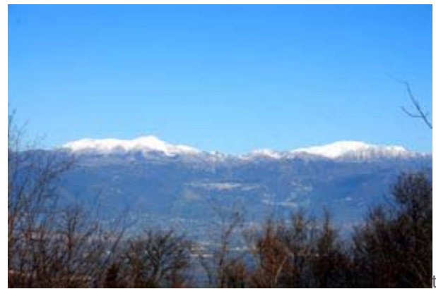
he Mountains of Matese

Molise and the beech woods of Montagnola di Frosolone and the Matese, which may not seem particularly exceptional but are of outstanding natural beauty. This world of natural beauty is crossed by the tratturi. The tratturi are ancient transhumance routes.