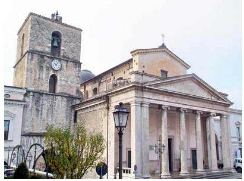
Isernia – the Cathedral

Isernia, at 439 metres above sea-level, is the old Aesernia, allied of the Romans against Annibale. It conserves the remains of polygonal walls, temples, sepulchres, bridges and a Samnite-Roman aqueduct. The Romanic "Fontana Fraterna", and the neo-classic cathedral (rebuilt in 1857) are remarkable. The economy of the two cities, for the most part, has developed tertiary activities, and is carried out by public and private services. Besides the regional, provincial and municipal departments, there are Health, transport, banking, insurance, educational institutions and commercial services.